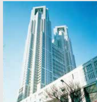
Tokyo Metropolitan Government Building [Government Facility]

Marina Bay Financial Centre Tower is a huge commercial complex, symbolic of Singapore. Within its office tower, TOA's broadcasting system and speakers support efforts to establish a safe and comfortable environment.