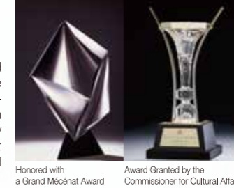
Honored with a Grand Mécénat Award | Award Granted by the Commissioner for Cultural Affairs

In 1995, TOA was honored with a Grand Mécénat Award at the Japan Mécénat Awards, acknowledging it as the company having contributed most to help promote artistic culture, by the Association for Corporate Support. In 2010, we were again honored with an Award Granted by the Commissioner for Cultural Affairs of Japan Mécénat Awards for our contributions to local revitalization and educating children.