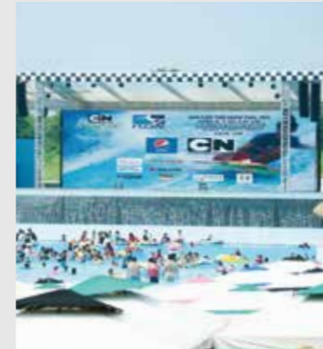
Cartoon Network Amazone [Theme Park]

ION ORCHARD is a huge shopping mall on Orchard Road in Singapore. Our Public address/Emergency broadcast system delivers the required information, while line array speakers support their event operations outside the building.