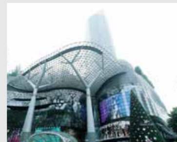
ION ORCHARD [Commercial Facility]

ION ORCHARD is a huge shopping mall on Orchard Road in Singapore. Our Public address/Emergency broadcast system delivers the required information, while line array speakers support their event operations outside the building.