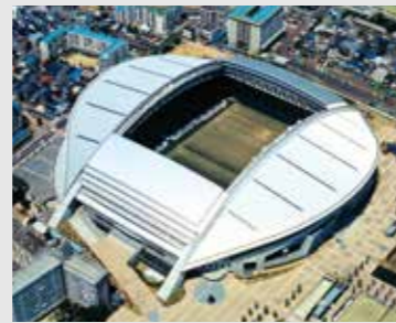
NOEVIR STADIUM KOBE [Sports Facility]

TOA's sound and information systems help each event proceed smoothly, while also boosting emotion and excitement at the venue.