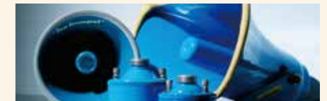
Reflex Trumpet Speaker (since 1947)

Many products that have underpinned our business have design concepts which remain applicable today, reflecting the level of innovation achieved at the time. Above all, Japan's first reflex trumpet speaker and a world-first electric megaphone have been further modified on an ongoing basis and catalyzed long-term company growth.