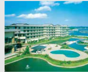
MATSUSHIMA ICHINOBO [Hotel]

TOA's sound and information systems help each event proceed smoothly, while also boosting emotion and excitement at the venue.