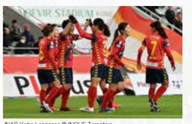
INAC Kobe Leonessa

TOA supports local events via its sound technology. Kobe Marathon