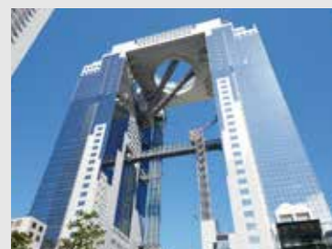
Umeda Sky Building [Complex]

This skyscraper's unique shape has made it an Osaka landmark. The building has become a popular sightseeing destination with guests from around the world, and their security and safety are ensured through TOA's Multi-language broadcast support system.