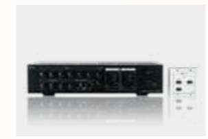
Amplifier for mosque

There are now five stages of TOA in the world: Establishing product development, production and sales bases in “Japan,” “China & East Asia,” “Asia & Pacific,” “Europe, Middle East & Africa” and “The Americas,” we will continue to grow.