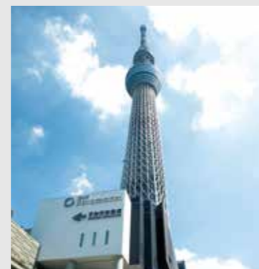
Tokyo SKYTREE TOWN® [Complex]

This skyscraper's unique shape has made it an Osaka landmark. The building has become a popular sightseeing destination with guests from around the world, and their security and safety are ensured through TOA's Multi-language broadcast support system.