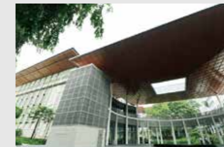
Yale-NUS College [Educational Facility]

Cartoon Network Amazone is one of the largest family-oriented water parks in Asia with Cartoon Network as theme; located in Pattaya, Thailand. TOA supports the establishment of a broadcasting system, including Line array speakers on the main stage.