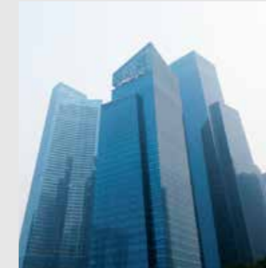
Marina Bay Financial Centre Tower [Complex]

The MATSUSHIMA Convention Hall installed in MATSUSHIMA ICHINOBO. We help establish a sound environment conducive for events within the hotel, including a range of conventions and wedding receptions.