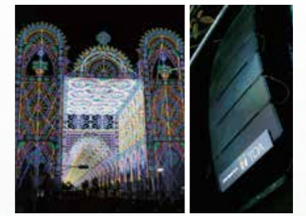
Kobe Luminarie

Kobe Luminarie is a seasonal winter tradition in Kobe, held each December and reflecting a wish for recovery from the Great Hanshin Earthquake and local revitalization. TOA participated in the event to oversee sound support at the main venue, which housed over 100 speakers and our originally composed music as part of a fantastical world.