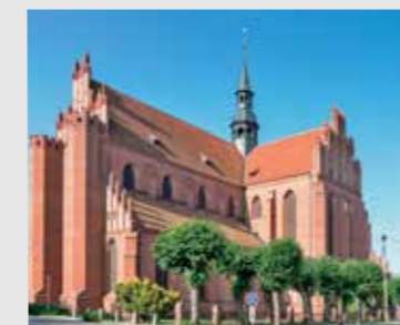
Cathedral Basilica of the Assumption of the Blessed Virgin Mary [House of Worship]

Tokyo SKYTREE TOWN® is a large-scale commercial complex, including the TOKYO SKYTREE®. TOA's Public address / Emergency broadcast system was introduced, supporting visitor safety and providing announcements.