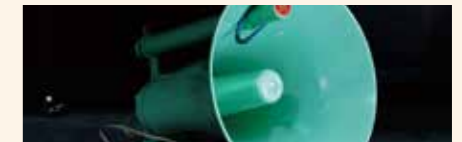
Electric Megaphone (since 1954)