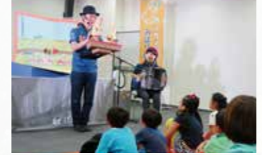
The Lookouts of KanKan Tower

Offering TOA's unique programs: "TOA Music Workshop" "The Lookouts of KanKan Tower"